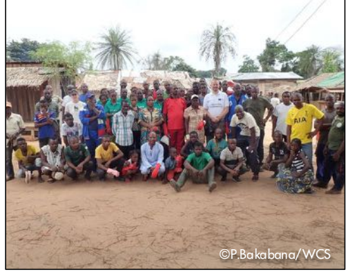
Salongo' session for public health led by the administrative authorities of Kabo District, assisted by NNNP agents and residents of Romassa