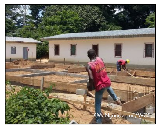
Construction work on the new lodging facility to accommodate ecoguards has started in Bomassa.