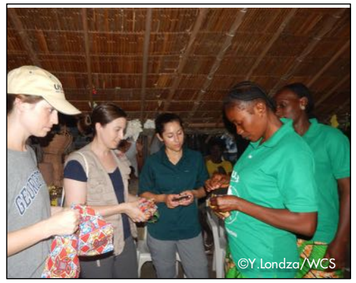
Meeting between USAid's delegation and the actors of the Bomassa community ecotourism project.